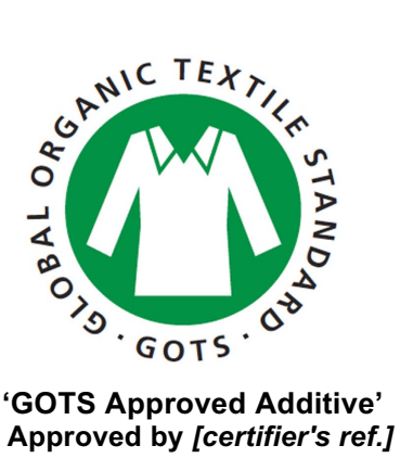
Approved by [certifier's ref.] [Approval Ref. number]